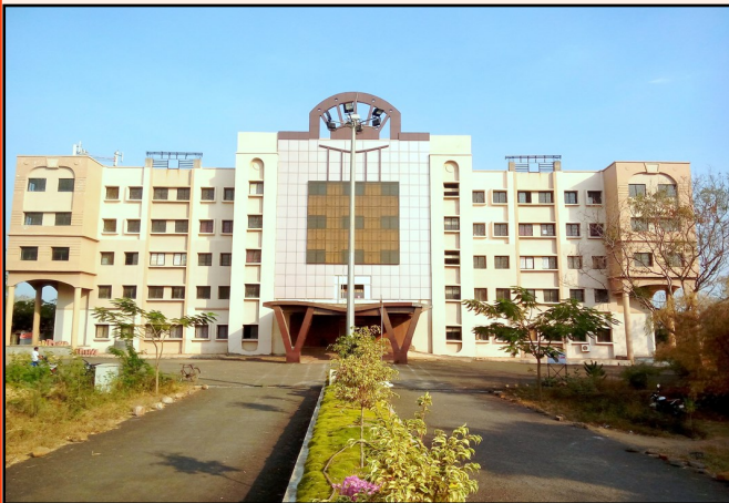
S.R.T.M.U.N's SUB-CENTRE, LATUR